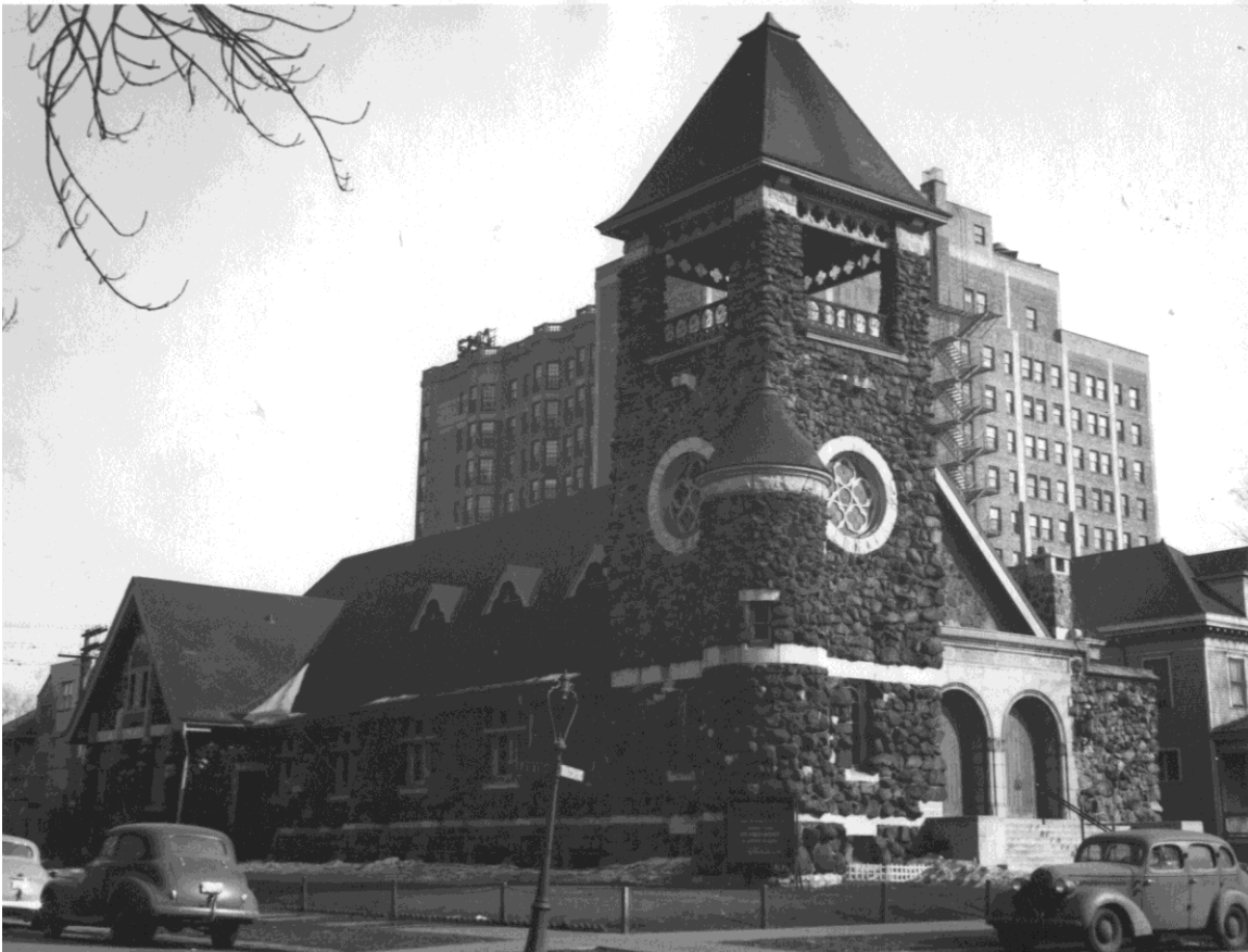
ABOVE: Epworth United Methodist Church, Chicago, Illinois in the 1940s.