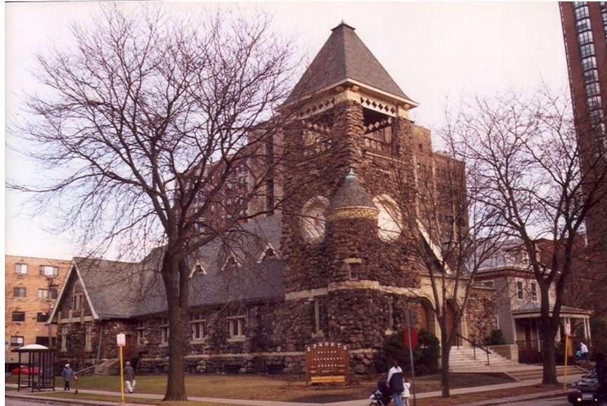
ABOVE: Epworth United Methodist Church, Chicago, Illinois in 1927 (top) and 2003 (bottom).

The Stopt Diapason , a journal devoted to the history of the organ in Chicago and the Midwest, is published quarterly by the Chicago-Midwest Chapter of the Organ Historical Society, Inc. The Chicago-Midwest Chapter is a not-for-profit corporation incorporated in the State of Illinois.