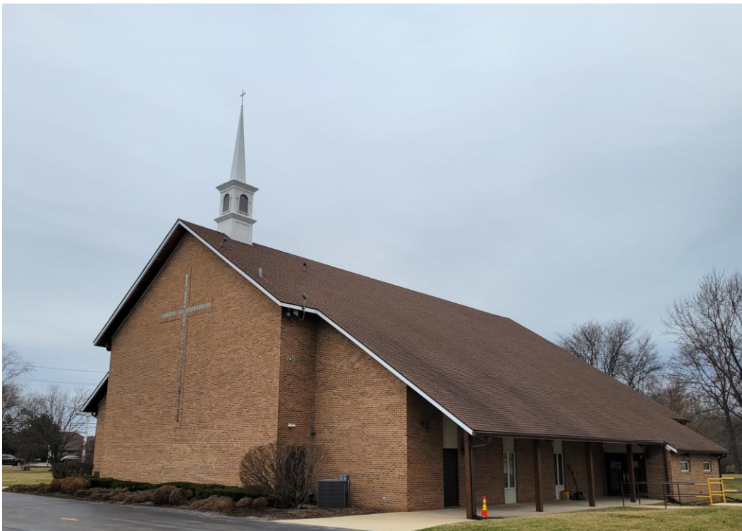
TOP ROW: St. Mark Lutheran Church, Lindenhurst, IL and the 1959 Möller organ; the chancel and the Antiphonal division at the rear of the church. MIDDLE ROW: Left and Right stop jambs. BOTTOM ROW: Exterior of St. Mark.