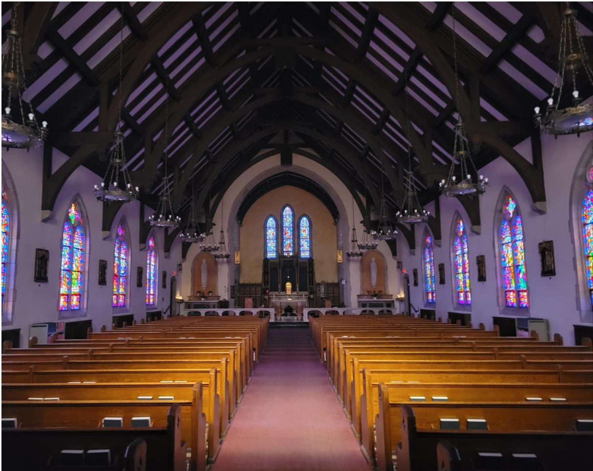
TOP ROW: St. Peter Catholic Church, Antioch; the rear gallery window and small window in the stairwell leading to the gallery. BOTTOM ROW: the nave looking toward the altar.