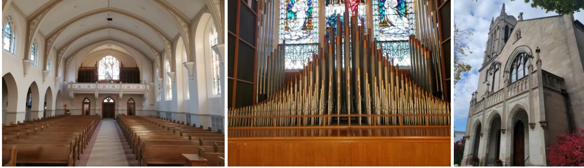
Sacred Heart Catholic Church 1077 Tower Road, Winnetka, Illinois Wicks Organ Company, Op. 3958, 1959; III/18