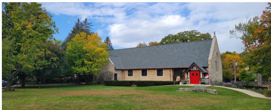
ABOVE: St. Elisabeth's Episcopal Church, Glencoe, IL