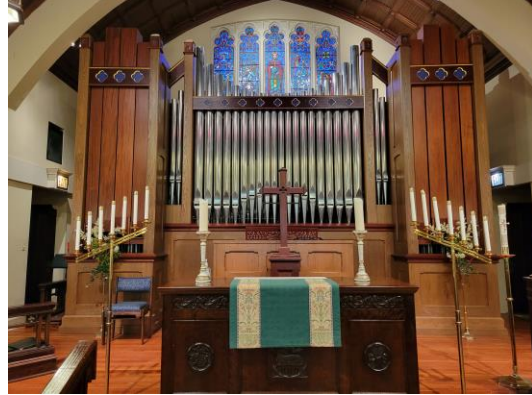
North Shore United Methodist Church 213 Hazel Avenue, Glencoe, Illinois John-Paul Buzard Pipe Organ Builders, Op. 24, 2001; III/17