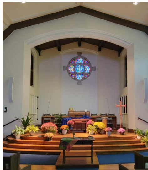
Glencoe Union Church 263 Park Avenue, Glencoe, Illinois Casavant Frères Op. 3465, 1980; II/29