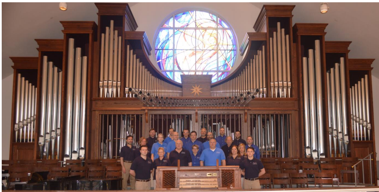
ABOVE: Members of Berghaus Organ Company at St. Raphael the Archangel, Naperville, IL, on the occasion of the 50 th anniversary of the founding of the company.