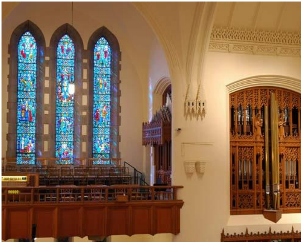
ABOVE: South organ chamber and choir loft at Grace Lutheran Church, River Forest. The Great and Pedal divisions are located in this chamber with the Positiv division exposed in front of the chamber facing the choir and console.