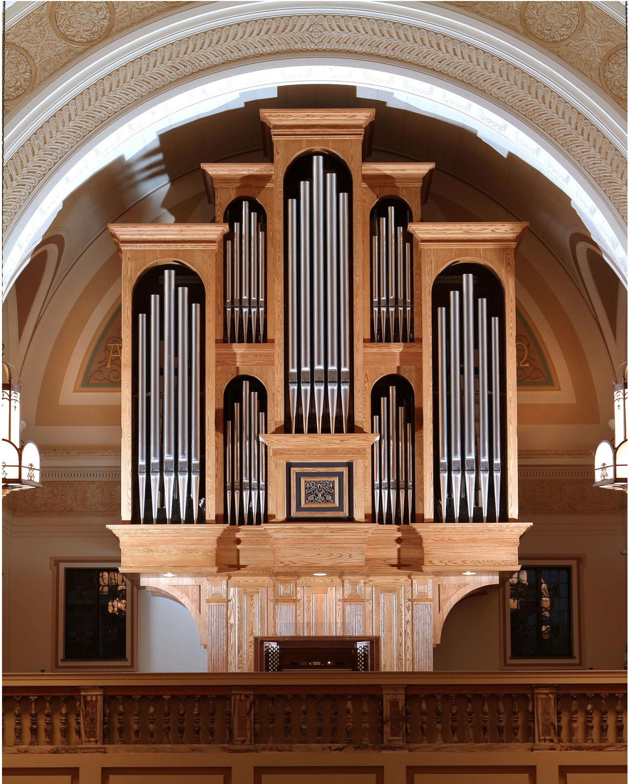
ABOVE: St. Francis Xavier Catholic Church, La Grange, IL