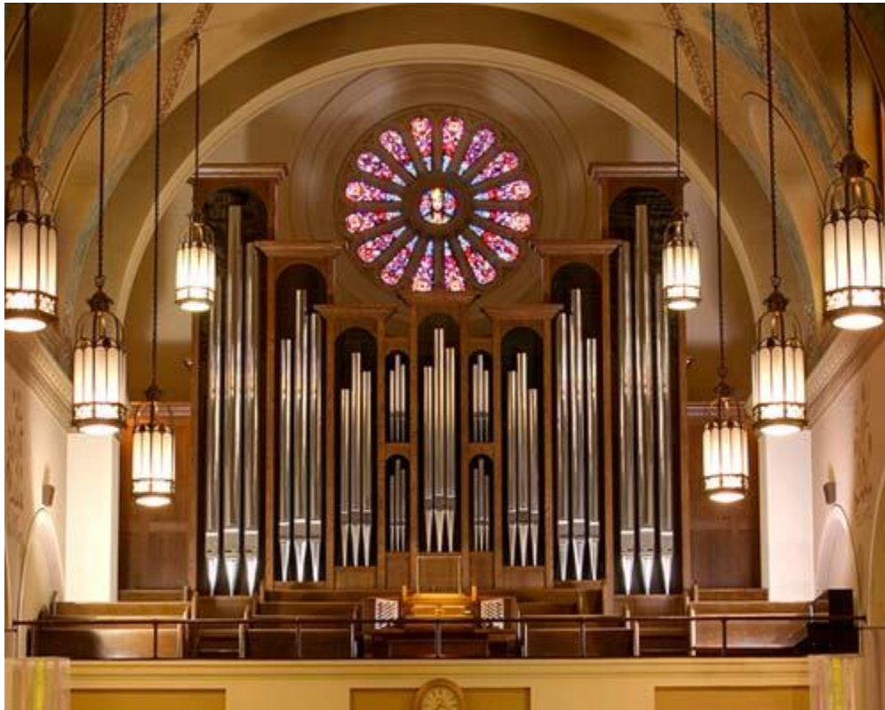
ABOVE: Ascension Roman Catholic Church, Oak Park, IL